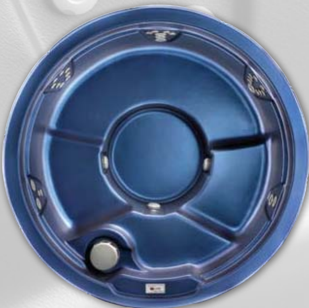
Shown in Indigo