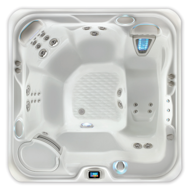
Aria NXT shown with Alpine White shell