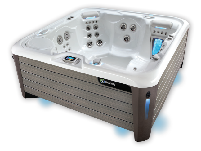
Aria NXT shown with Alpine White shell / Monterey Gray cabinet