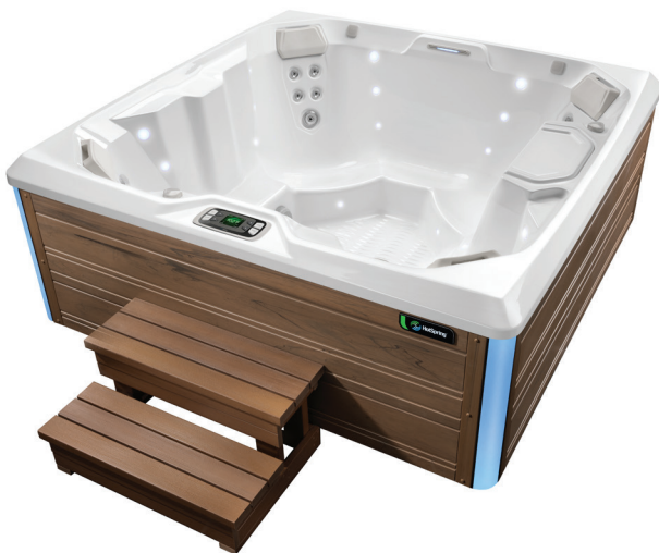
Beam shown with Alpine White shell & Sable cabinet