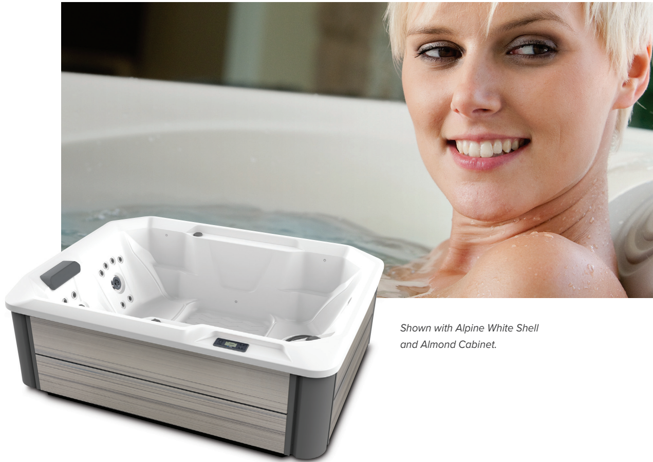
Shown with Alpine White Shell and Almond Cabinet.