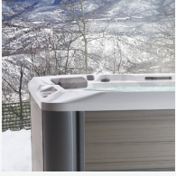
FiberCor® High-Density Insulation