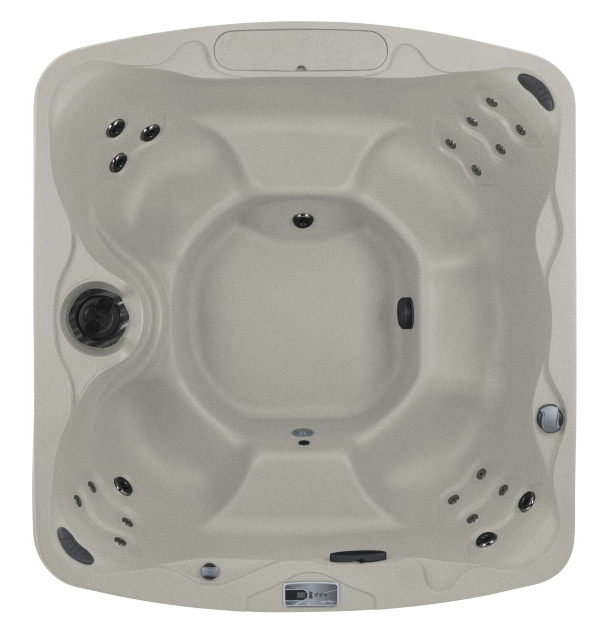
Monterey Premier shown in Sand