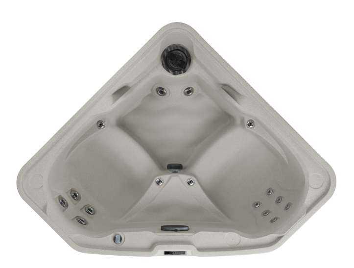
Tristar shown in Sand