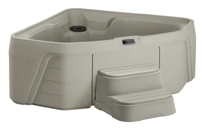
Tristar shown in Sand