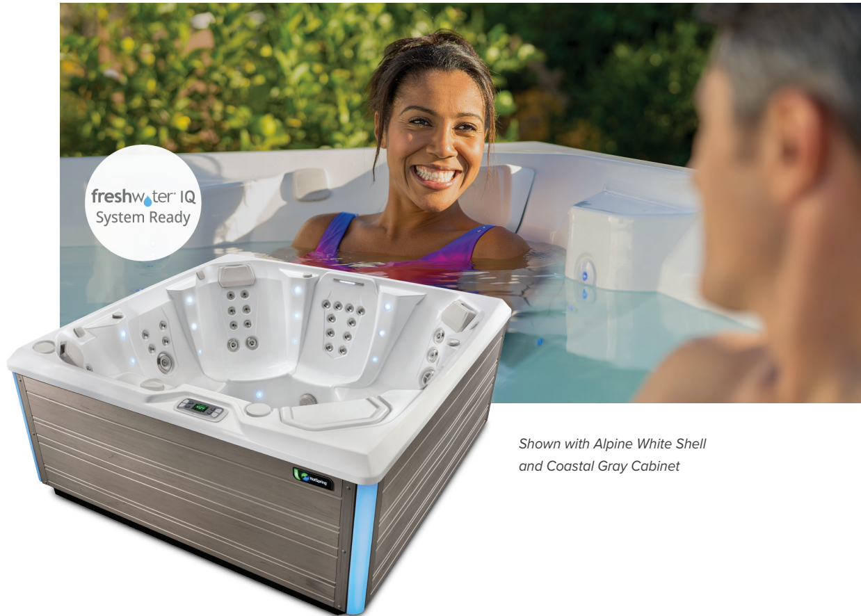
Shown with Alpine White Shell and Coastal Gray Cabinet

People Seating Jets Voltage 7 Seats Open 41 Jets 230 V