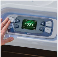
Color LCD Display